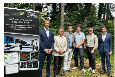
Visitron powerful sales and application team