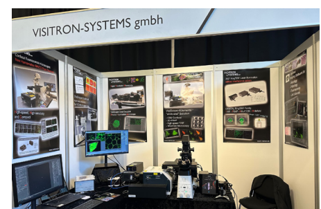
Visitron joining and supporting many local and international Conferences like FOM, ELMI, Cell Bioplogy...