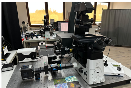
Production and system configuration and testing before installation