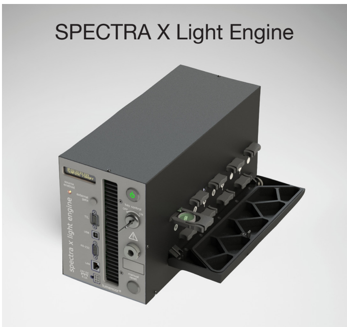
SPECTRA X Light Engine